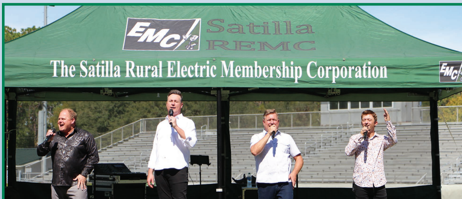
Entertainment Anthem Edition