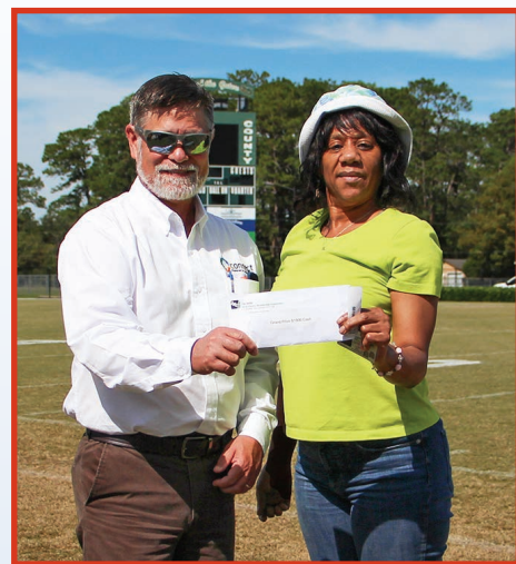
Grand Prize Winner $1,500 Cash